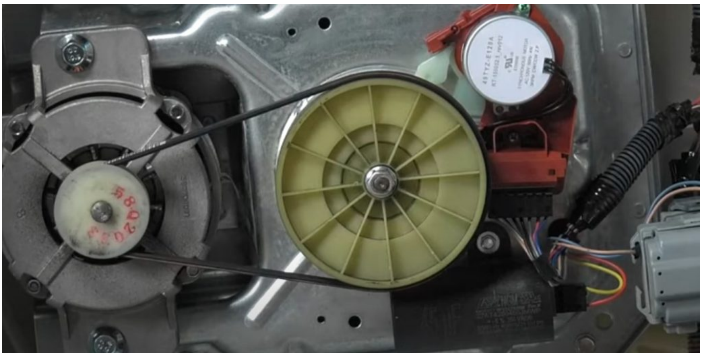
Check and Adjust the Drive Belt

Another potential source of grinding noise in your Samsung Washing Machine is a damaged or loose drive belt. The drive belt transfers power from the motor to the drum, enabling it to spin. Over time, the belt can wear out, become misaligned, or snap, causing grinding or squealing noises as it slips.