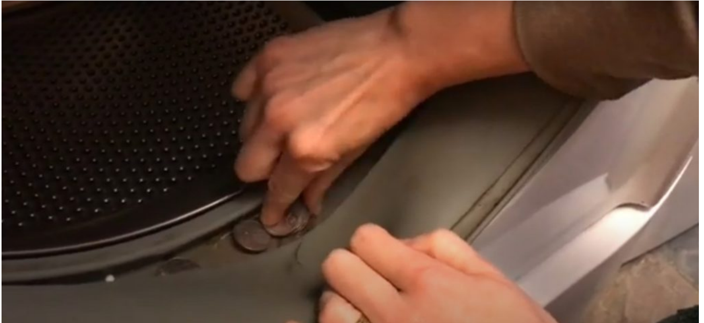
Foreign Object in your Washing Machine