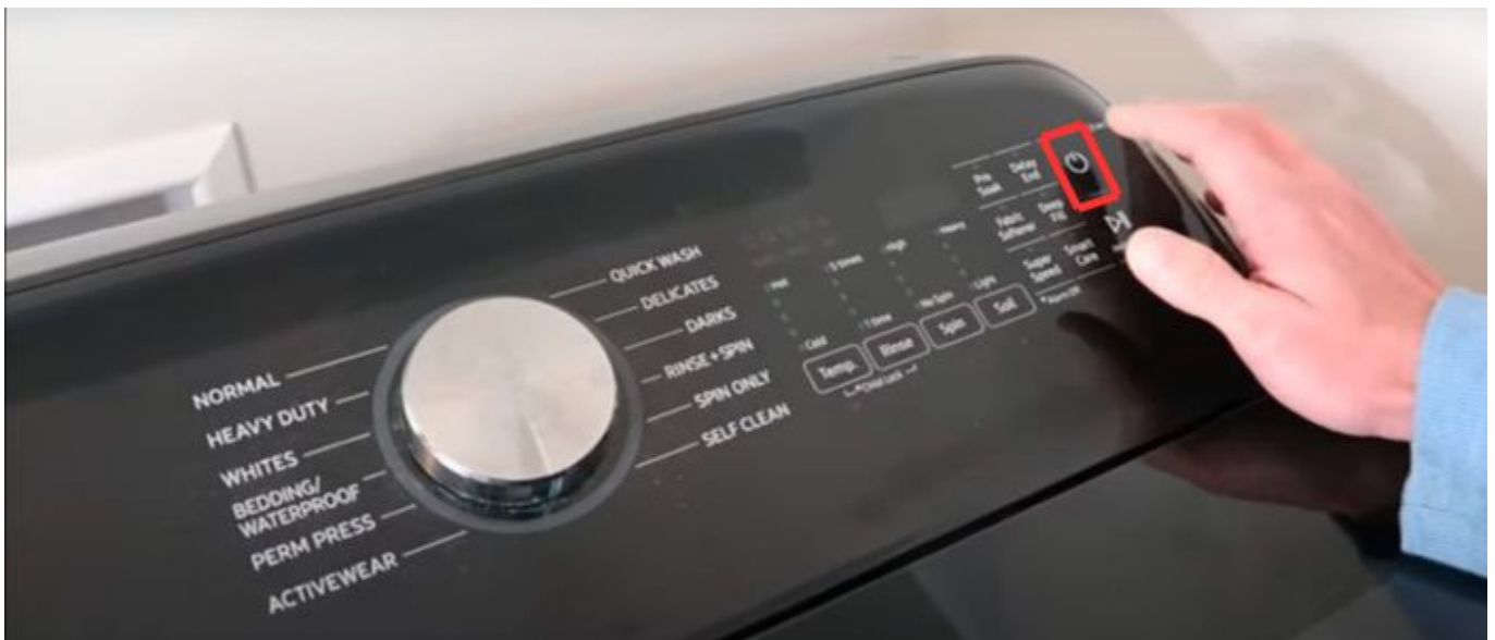
Turning on the Samsung Washing Machine

Solution: Start by turning off and unplugging your washing machine. Manually turn the drum to see if you can replicate the grinding noise. If the drum feels stiff, or you hear grinding even when it's off, the issue is likely mechanical, such as worn bearings or a faulty belt. If the drum spins freely but the noise persists during operation, the motor may be the culprit.