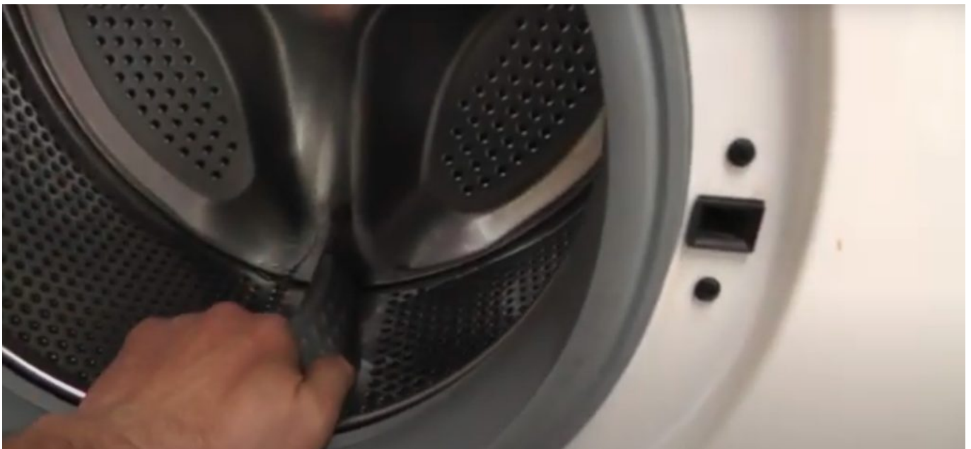
Inspect and Replace Drum Bearings

Samsung washing machines rely on these bearings to rotate the drum smoothly. Over time, as they wear out, they can create loud grinding or rumbling noises. Replacing drum bearings can be a complex task, but it is necessary to prevent further damage to your machine.